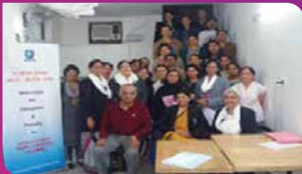
Academic Centre & Library: B-235, C R Park, New Delhi